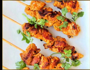
4 Pcs CHICKEN SHISH