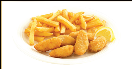
6 Pcs SCAMPI