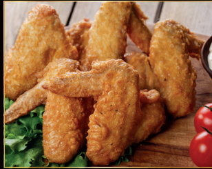
4 Pcs CHICKEN WINGS