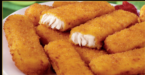
4 Pcs FISH FINGERS