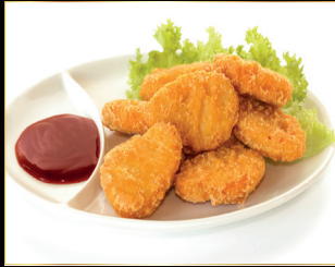
5 Pcs CHICKEN NUGGETS